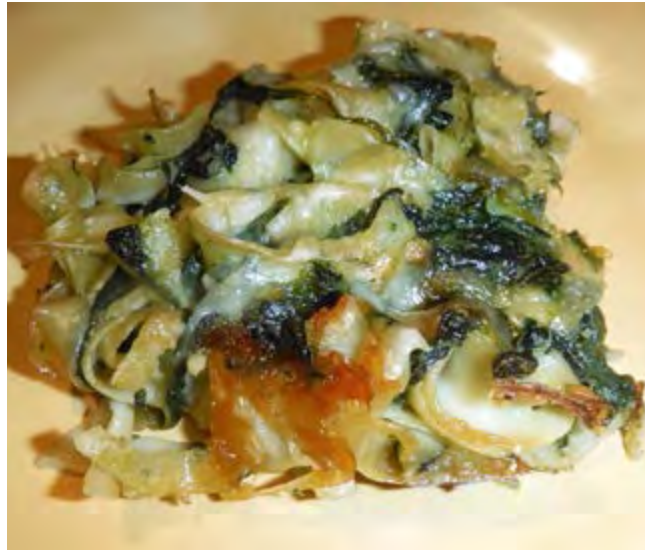
Spinach-Gruyere noodle casserole